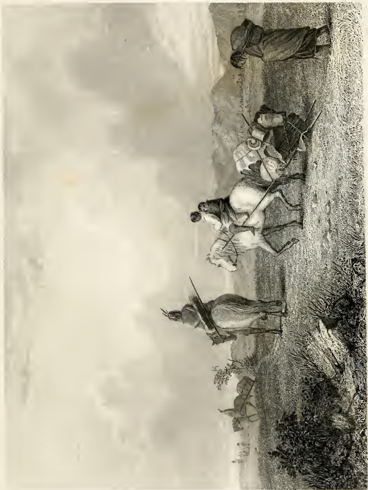
THE MOUNTAIN CARAVAN, FAMOUS IN THE EAST.